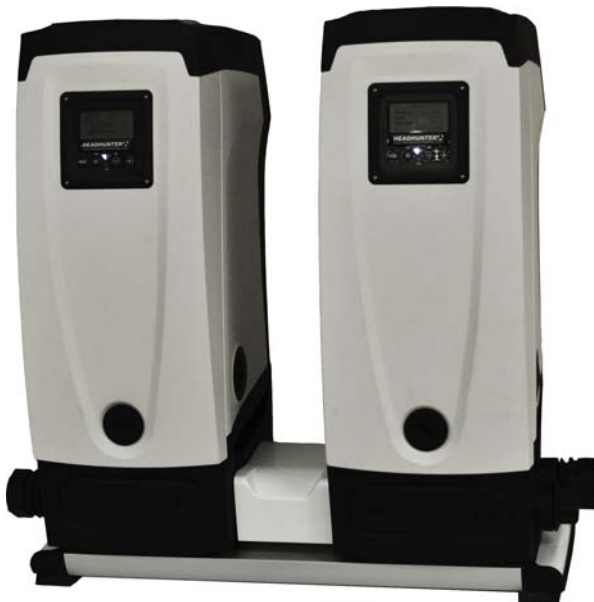
Aqua-Box Pump Set: 2x AQX-230 and an AQX-TWIN bracket

Shipping Wt. AQX-230= 64 lbs AQX-TWIN= 30 lbs